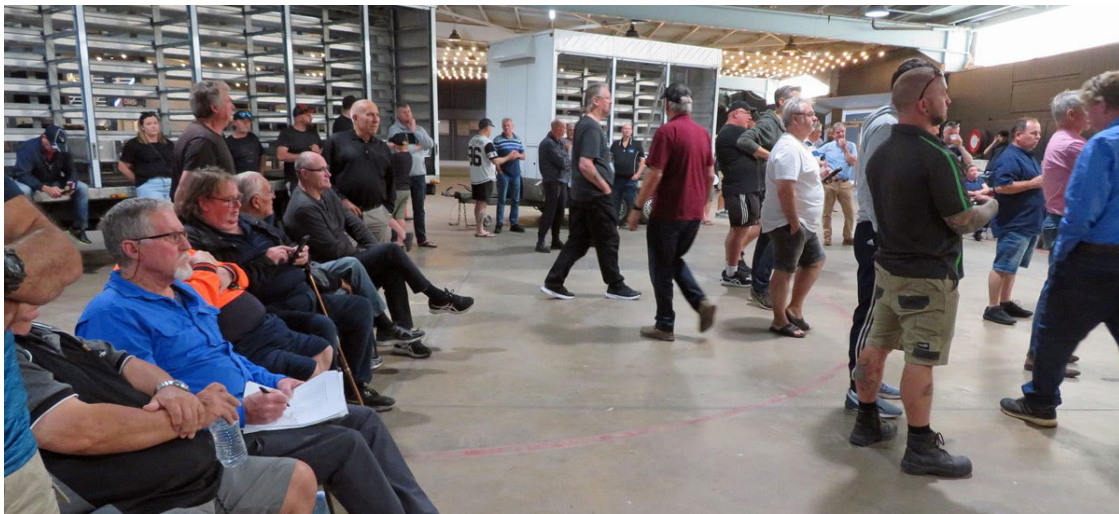
The main arena of the auction area

On Friday the members of the SAHPA prepared the Angle Park Greyhound racing complex for the auction area and the product displays. The centre piece was the SAHPA Geraldty transport unit which was purpose built for the SAHPA flyers. You could feel the anticipation in the main arena and the vision of the convention was about to come to fruition.