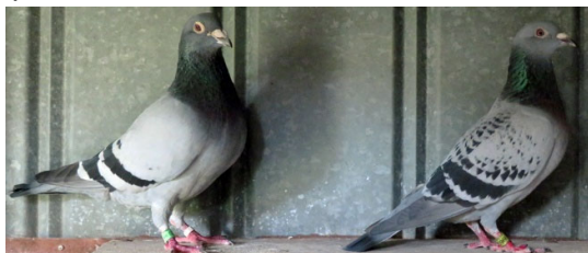
NH15 1120 and SA21 19965 (Emmdale winner)

Recovery is usually pigeon indicated: rest upon return, nil additives in the water and race mix upon return.